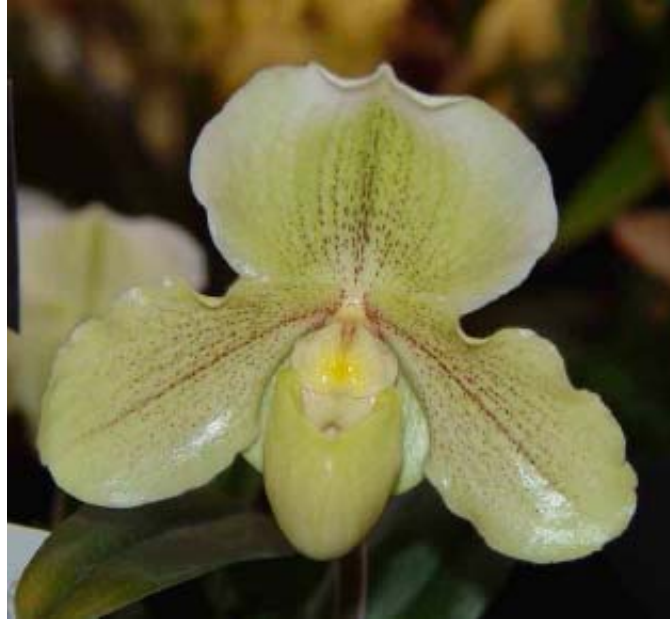
Paph. White King 'Dianne' HCC AOS